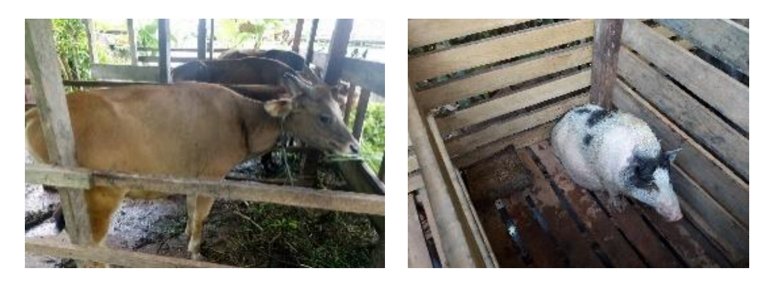
Raising cows and pigs for manure to feed biogas digester and produce biogas energy

Under the project, generation of biogas and its utilization in the processing of NTFPs was demonstrated. The Sadap and Kelayam communities had been trained on the making of brown palm sugar, fruit cakes and bamboo shoot chips noting that Kelayam community