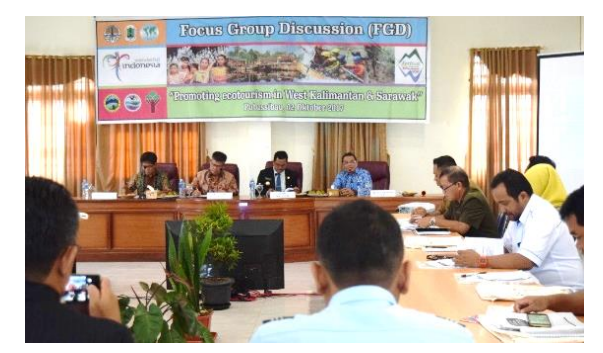
FGD on promoting ecotourism in West Kalimantan and Sarawak

conservation as well as local livelihood development in particular. Enhanced cooperation means