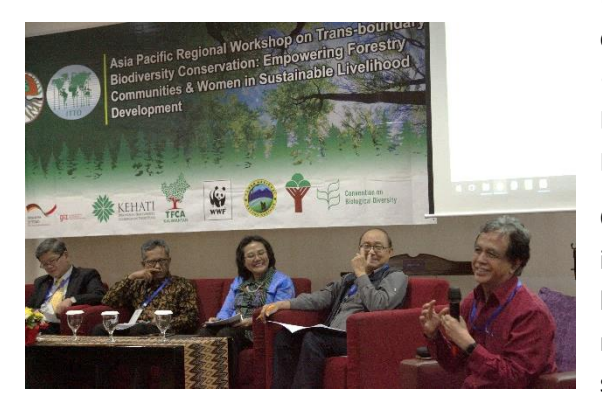
A plenary session of the Asia-Pacific Regional Workshop on TBCA Management