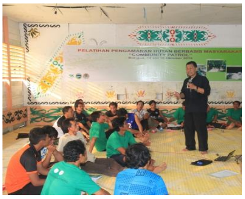
Dialog with local community and local government on livelihood and park conservation

In light of above assessment, it is reasonable to conclude that: biodiversity data updating and assessment of biodiversity conservation status have been partially completed while implementation of BKNP management plan has not been actually enhanced for the following reasons: