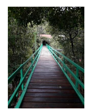
Renovated wooden bridge at Tekenang